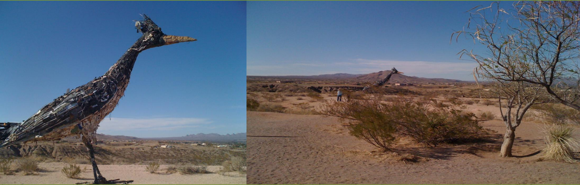
Pictured above – the Roadrunner Sentinel of Las Cruces