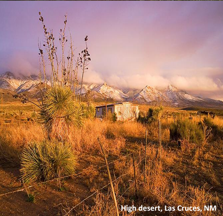
High desert, Las Cruces, NM

Any additional airline taxes or fees due to fuel costs will be announced and will be the student's responsibility to pay.