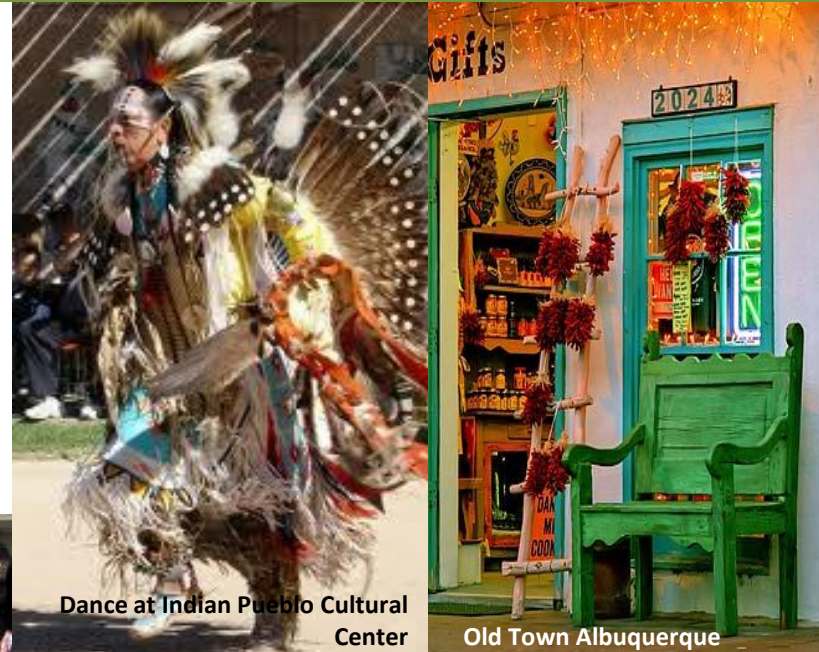
Dance at Indian Pueblo Cultural Center

May 10 Tour Albuquerque, NM ; - visit historic Old Town Albuquerque ; - visit the Indian Pueblo Cultural Center - leave Albuquerque and drive scenic Route 25 to Las Cruces, NM where you will stay for the remainder of the trip