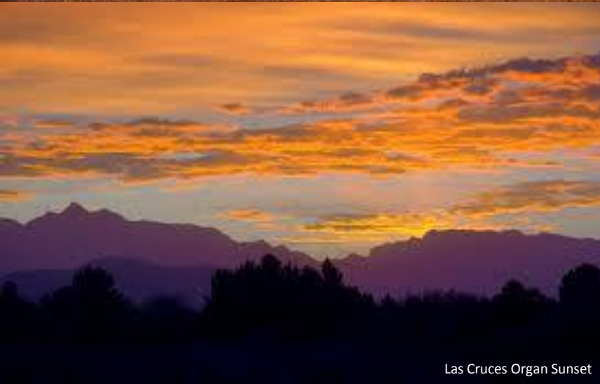
Las Cruces Organ Sunset

The course fee is $1,485 and includes a 9-day study tour to Albuquerque and Las Cruces, NM, including: