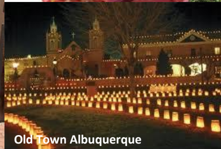
Old Town Albuquerque