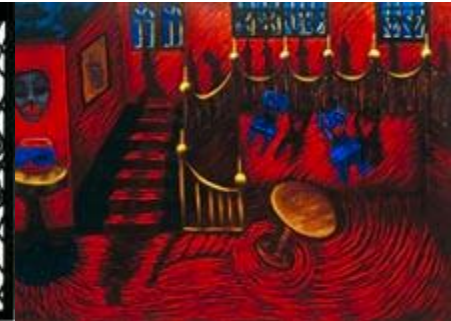
House of Spirits

From the Permanent Collection of the National Hispanic Culture