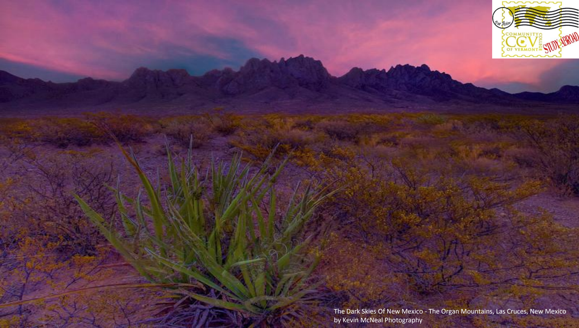
The Dark Skies Of New Mexico - The Organ Mountains, Las Cruces, New Mexico