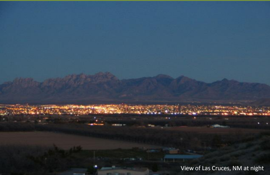
View of Las Cruces, NM at night

* Travel to New Mexico is May 9 – May 17, 2012