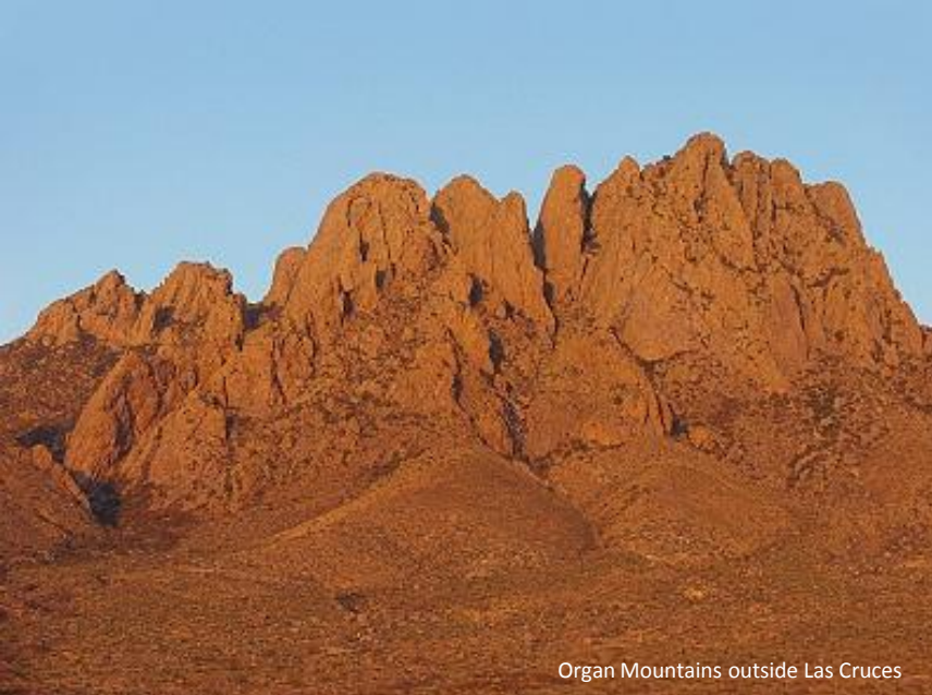
Organ Mountains outside Las Cruces